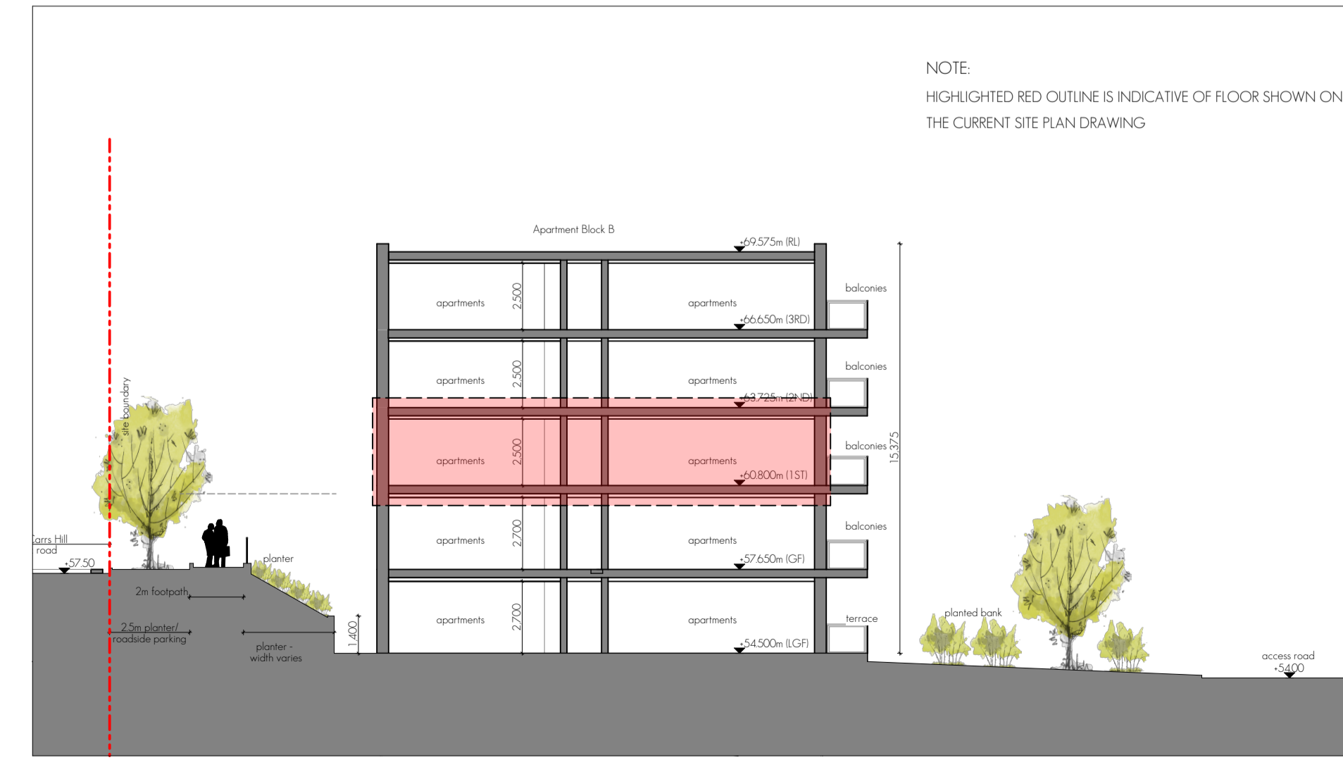
Section A-A 1:200

PLEASE REFER TO HQA REPORT 18205-REP-015, FOR ALL UNIT NUMBERS, ORIENTATIONS ETC