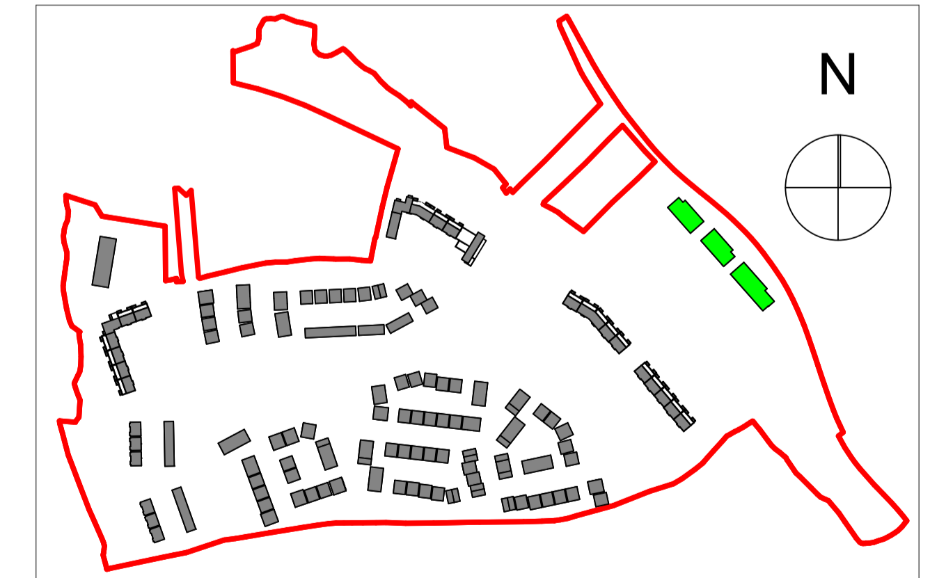
SITE KEY PLAN 1:5000